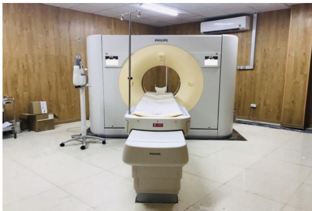
256-slice CT Scanner

Especially, modern equipments such as atherosclerosis screening machine for early detection and prevention of atherosclerotic diseases such as stroke, myocardial infarction ... Liver fibrometer helps prevent , early detection of alcoholic liver fibrosis ,caused by viral hepatitis, assess degree of hepatic steatosis