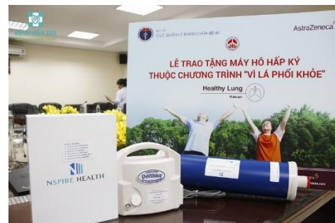
Respiratory function mete