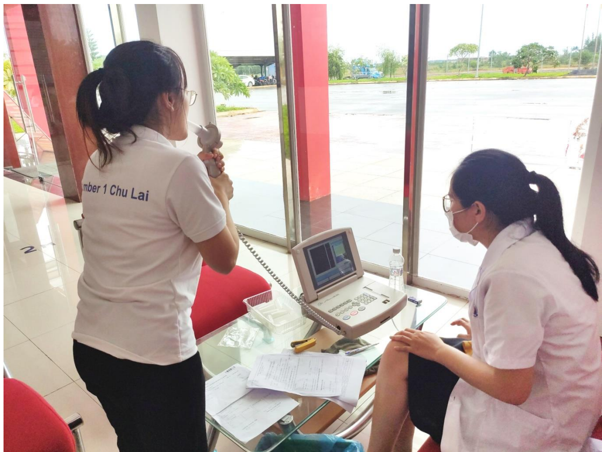
Respiratory function measurement in Occupational disease examination