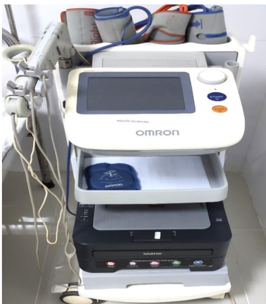
Atherosclerosis screening machine