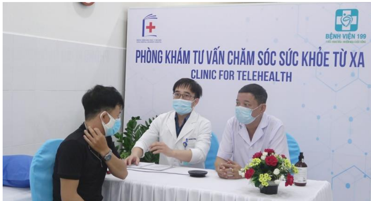
Telehelth - Telehelth Room