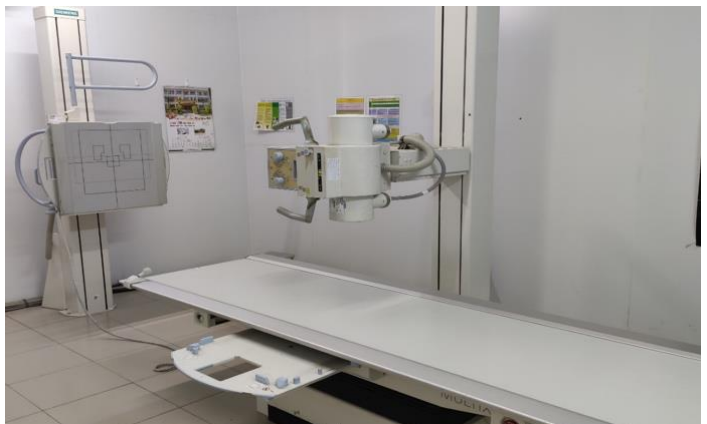
Digital radiography machine