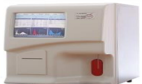
HUMALYZER 2000 Biochemistry