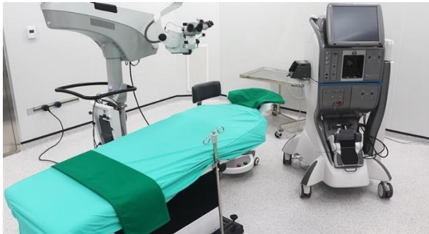
Phaco surgery machine