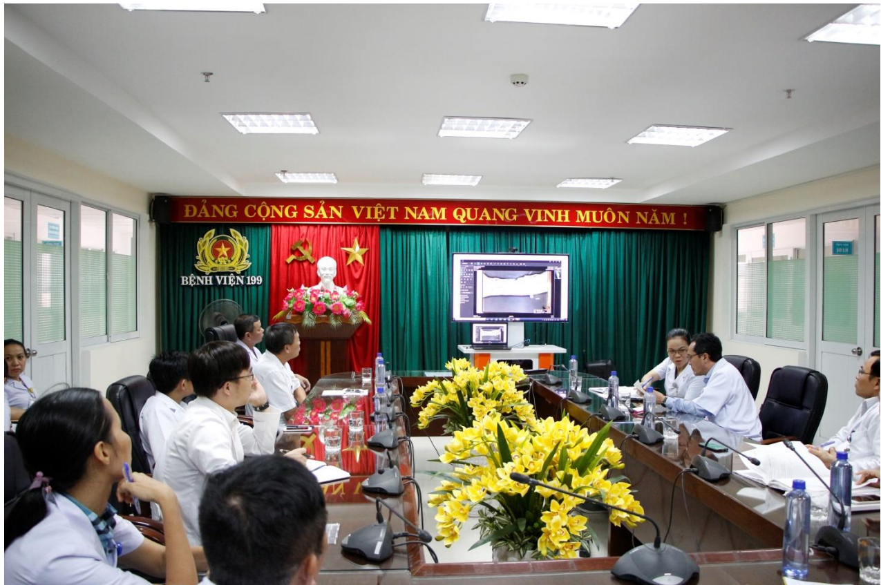
Teleconsultation with Ha Noi Medical University