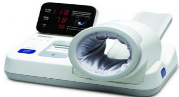
Electronic blood pressure monitor